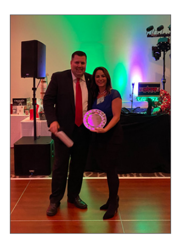
Thank you for attending